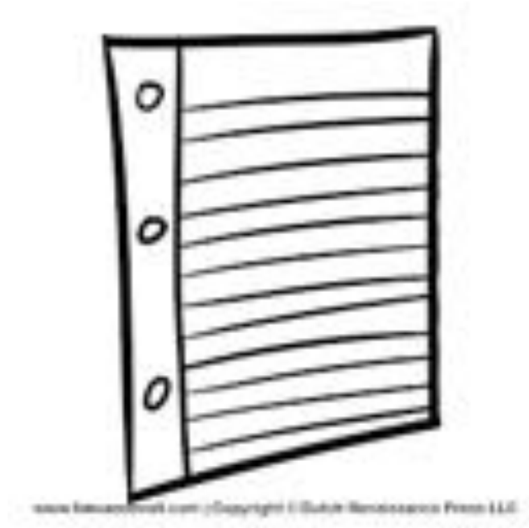
a piece of paper